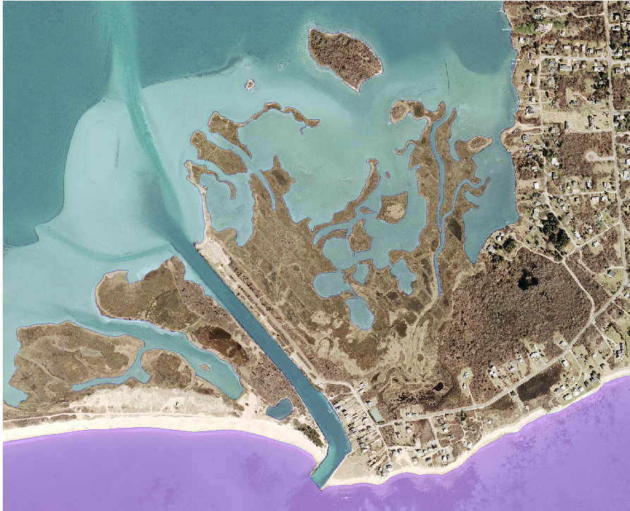
Figure 1 – Water body (in blue) and coastal polygon (in purple), here the islands have been punched out the water body but there were previously acquired as 2 separated feature classes.