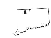
QUARTER QUADRANGLE LOCATION