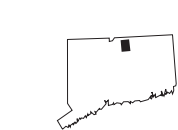
QUARTER QUADRANGLE LOCATION