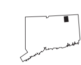
QUARTER QUADRANGLE LOCATION