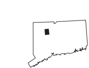
QUARTER QUADRANGLE LOCATION