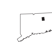
QUARTER QUADRANGLE LOCATION