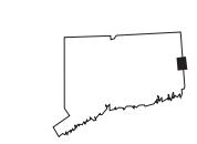
QUARTER QUADRANGLE LOCATION