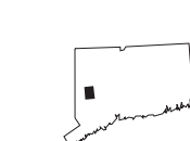
QUARTER QUADRANGLE LOCATION