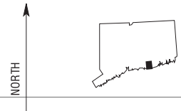
QUARTER QUADRANGLE LOCATION

North American Datum of 1983 (NAD83), GRS80 Spheroid 1000-meter ticks: Universal Transverse Mercator, zone 18. Coordinate grid ticks and land division data, if shown, are approximately positioned. Digital data are available for this quadrangle.