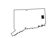
QUARTER QUADRANGLE LOCATION