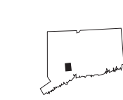
QUARTER QUADRANGLE LOCATION