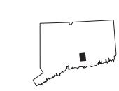
QUARTER QUADRANGLE LOCATION