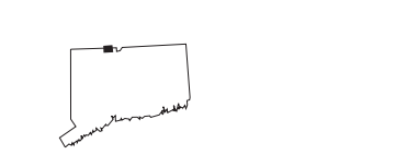
QUARTER QUADRANGLE LOCATION