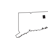
QUARTER QUADRANGLE LOCATION