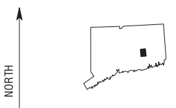
QUARTER QUADRANGLE LOCATION

This soil survey was compiled by the U.S. Department of Agriculture, Natural Resources Conservation Service and cooperating agencies. Base maps are orthophotographs prepared by the Natural Resources Conservation Service from 1990-1992 aerial photography. Hydrography and cultural features were acquired from USGS and NRCS and edited to enhance the clarity of the soils information. North American Datum of 1983 (NAD83), GRS80 Spheroid 1:000-meter ticks; Universal Transverse Mercator, zone 18. Coordinate grid ticks and land division data, if shown, are approximately positioned. Digital data are available for this quadrangle.